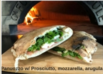
Panuozzo w/ Prosciutto, mozzarella, arugula

308 N Federal Hwy, Boynton Bch FREE parking garage : 561-536-4100 ciao@pizzeriathatsamore.com