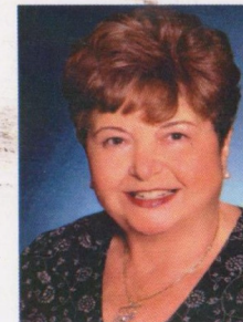
Member of Who's Who in Luxury Real Estate™